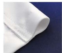
Pole Pocket Sleeve - Back View

How it's made: This product needs setup top and bottom material that we fold over and sew to form the pole pocket sleeve. Verticals are not hemmed.