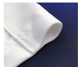
Pole Pocket Sleeve - Back View

How it's made: This product needs setup top and bottom material that we fold over and sew to form the pole pocket sleeve. Verticals are not hemmed.