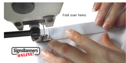
Hemming Edge - Back View

How it's made: This product needs top, right, bottom and left material that we fold over and sew to form the hem.